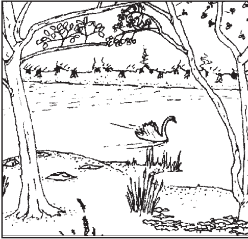
A Swan on Hillsborough Lake